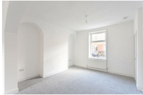
GROUND FLOOR 437 sq.ft. (40.6 sq.m.) approx.

IMPORTANT NOTE: These particulars and the descriptions and measurements herein do not constitute representation and whilst every effort has been made to ensure accuracy, this cannot be guaranteed.